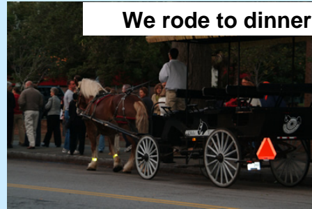
We rode to dinner in style