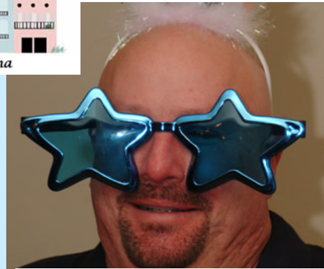
“Welcome to SAIR, Newcomer! Wait....where are you going?!!”