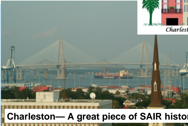
Charleston— A great piece of SAIR history