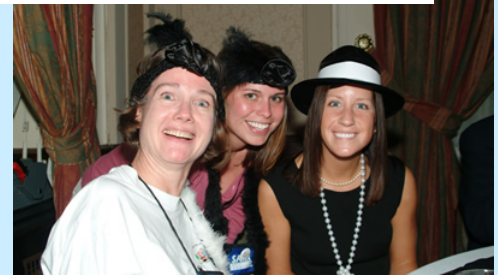
Partying the Charleston way