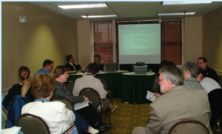
Gathering new ideas to take home