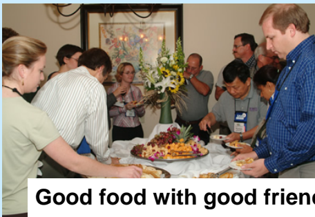
Good food with good friends