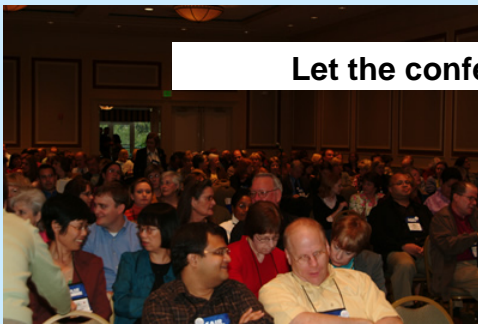
Let the conference begin!