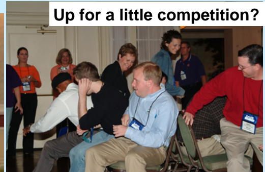
Up for a little competition?